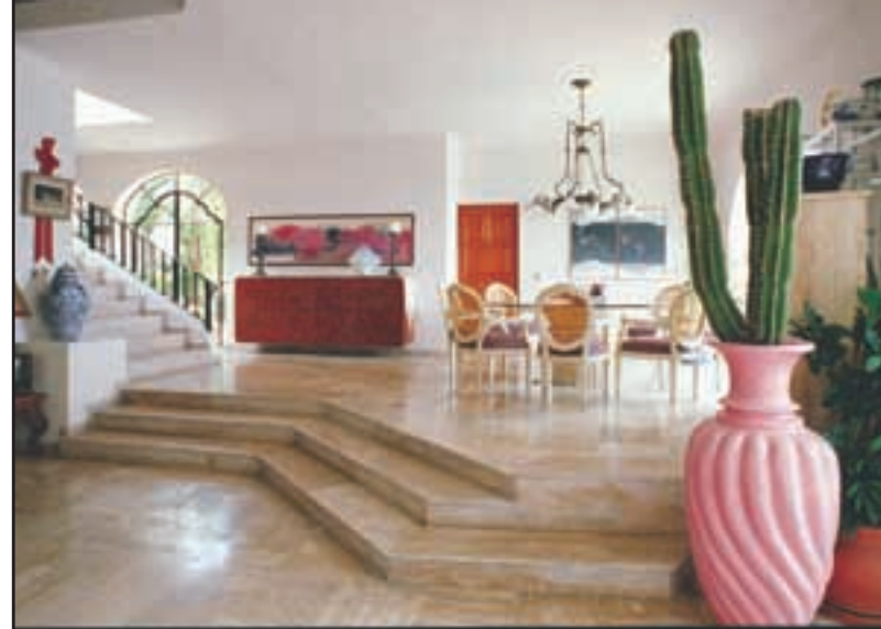
living room/dining room

The master suite of pink marble with a wrap around terrace, encompasses 1000 square feet. A perfect hideaway, with a king size bed complete with sitting room, music, television