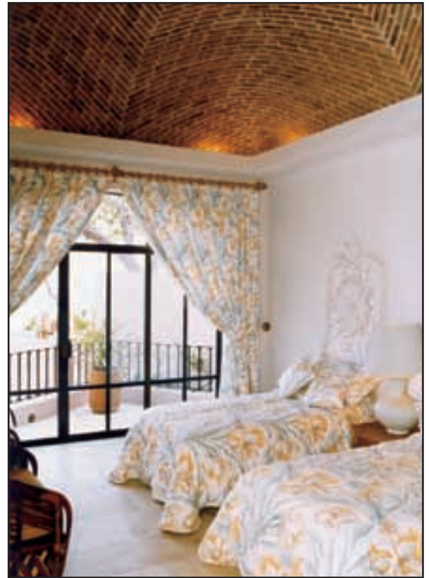
typical guest room